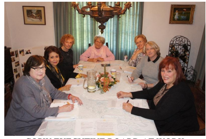
COPW EXECUTIVE BOARD AT WORK

LETTER AND NEWS WEBSITE: Will be reviewed and revised as necessary to upgrade content and insure promulgation of our COPW brand.